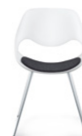
With seat cushion