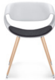
With seat cushion