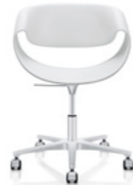
Height-adjustable with castors