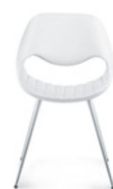
Full leather or fabric