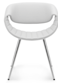
Full leather or fabric